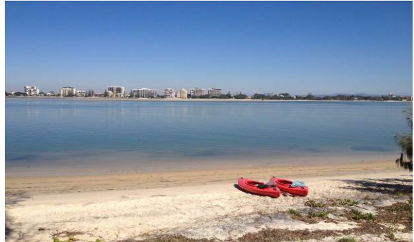
(At Bribie Island looking back to Golden Beach)