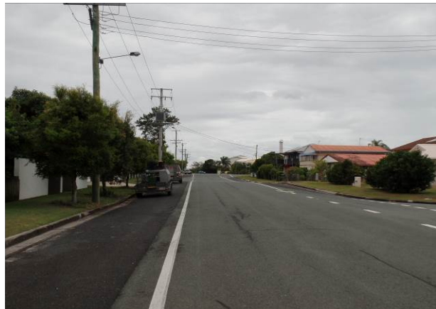
(View from footpath to beach at end of street)